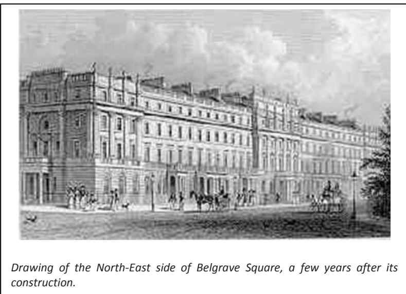
Drawing of the North-East side of Belgrave Square, a few years after its construction.

The original scheme consisted of four terraces, designed by George Basevi, each made up of eleven grand white stuccoed houses; three detached mansions in the corners, individually designed and at the centre, one of the grandest and largest XIXth century square. The numbering was anti-clockwise from the north. By 1840 most of the houses were built and occupied.